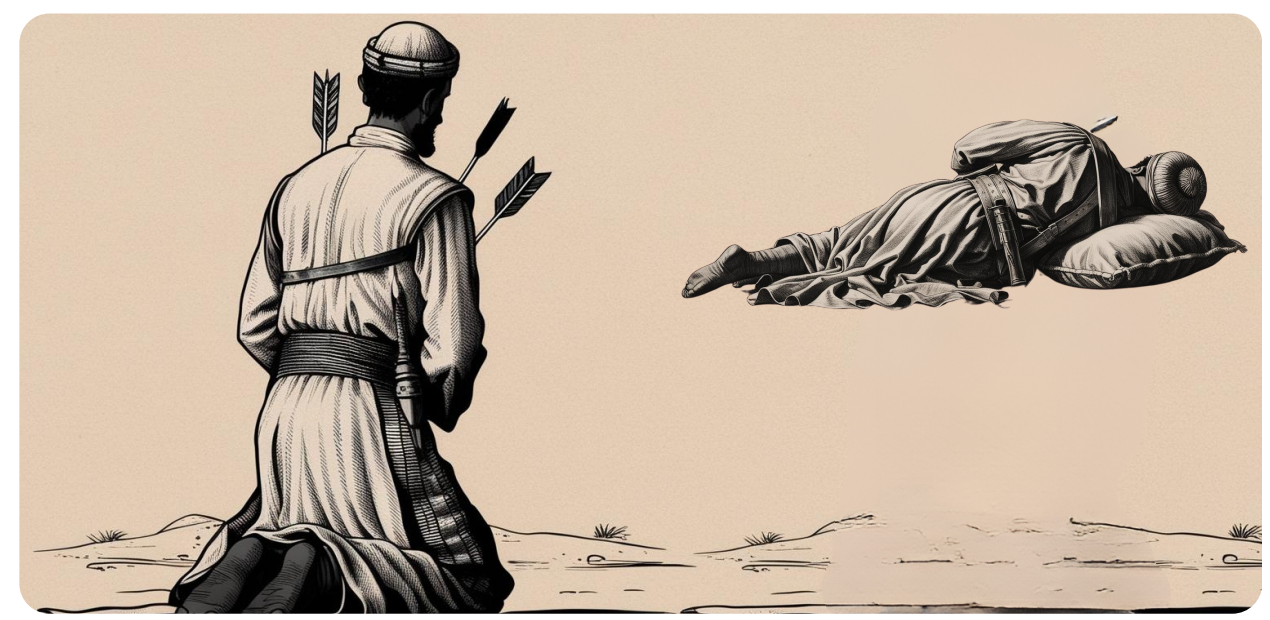
Explain what happened to 'Abbad ibn Bishr while he was guarding the Mulims' camp at night.